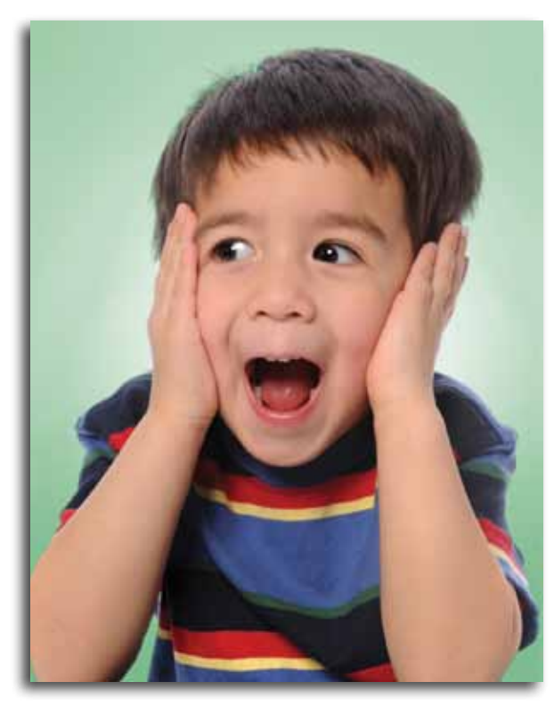
All four featured early child development programs provided comprehensive services to families.

While these four ECD programs were all targeted, the methods for identifying populations at risk varied. Evaluators for CCPC and Perry Preschool identified children on the basis of living in socio-economically disadvantaged families. <sup>16, 17</sup> Meanwhile researchers for Mauritius identified children on the basis of risk for developing mental disorders. <sup>18</sup> In contrast, for BBBF, communities were identified as being socio-economically disadvantaged, then the program was provided universally to all children within those communities. <sup>19</sup> Table 2 describes other characteristics of these four programs.