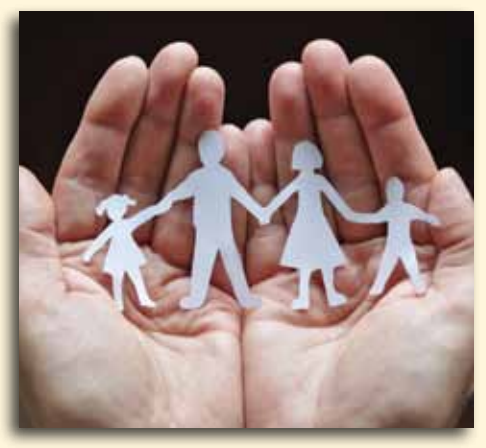
Letters Carefully counting cases, Carefully choosing words