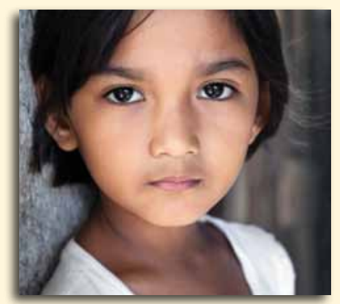
Overview Laying the foundation for lifelong mental health