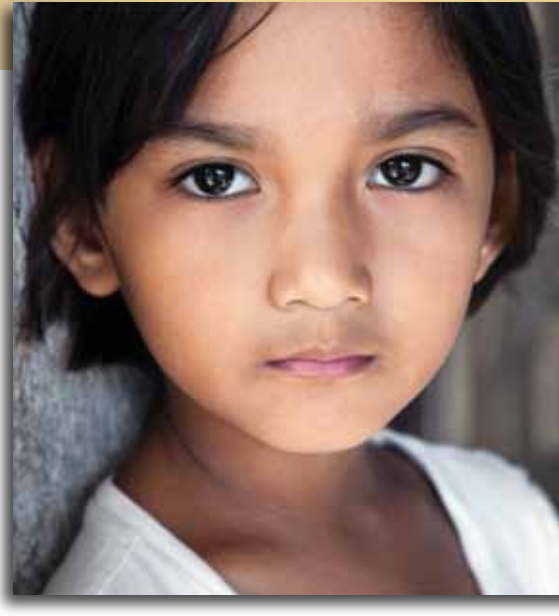
It is children's cumulative experiences with multiple, interacting risk and protective factors that ultimately influence social and emotional development.

hildren undergo tremendous developmental changes during their first six years. In addition to physical and cognitive development, there are numerous social and emotional — or mental health — gains in the early years. Table 1 highlights just a few of the important early mental health milestones. These interconnected developmental gains lay the foundation for subsequent lifelong learning, healthy relationships and contributions to society.<sup>2</sup>